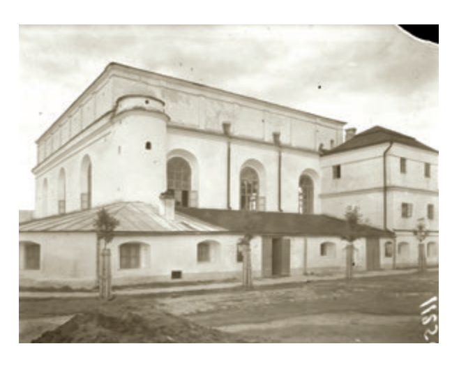
Synagogue in Pinsk, 1929.

disasters, the Jews of Pinsk requested the Grand Duke of Lithuania to exempt them from all taxes and fees so that they had the resources to rebuild their houses and restore their estates. They were granted the exemption for six years. ¶ At the beginning of the 17th century, the Pinsk kahal was one of three main communities of the Lithuanian Vaad. Pinsk and its Jewish community suffered greatly during the Cossack invasions in the 17th and early 18th century. Supported by the town Orthodox residents, these wars devastated the Jewish community of Pinsk. The local Jewish community also suffered during the Russo-Polish War of 1654–1667, when the town turned into one of the battlefields. In 1654, Pinsk was burnt down by the Russian troops, and in 1660, the town was captured and