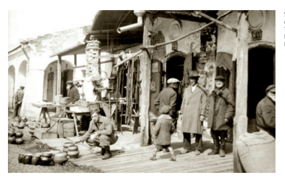
Street trading in front of market halls in Pinsk, 1935

the attainment of spiritual excellence precipitates the coming of the Messiah. Aaron II, as well as some other Hasidic masters, for example, Israel of Ruzhin, provided spiritual and financial aid to the communities of Karliner Hasidim who settled in the the land of Israel. In 1867, he moved to Stolin. In the mid-19<sup>th</sup> century, the counrt of Hasidic masters in Karlin produced most famous tunes and songs for Shabbat and festival liturgy of that Hasidic trend which are used to-date among the followers of the movement and far beyond it.