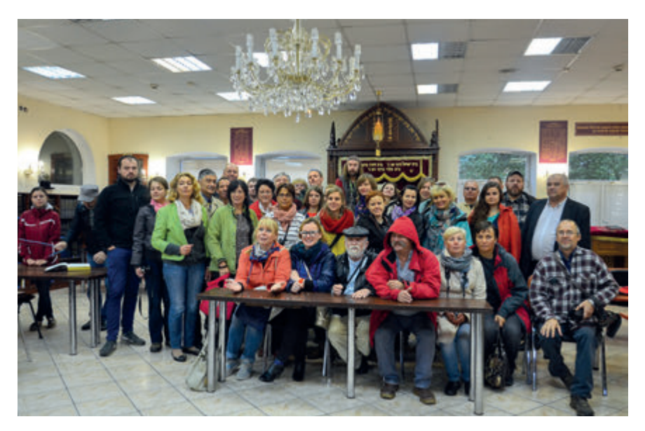
Participants in Shtetl Routes tour guides training inside the functioning synagogue in Pinsk-Karlin, at 12 Irkutska-Pinskai Dyvizii St., 2015.

Dobra Wola forest wilderness, occupation authorities carried out the operation of burning dead bodies and destroying the vestiges of mass extermination. ¶ About 25,000 Jews were murdered in Pinsk during the Holocaust. On July 4, 1944, Soviet troops entered the town.